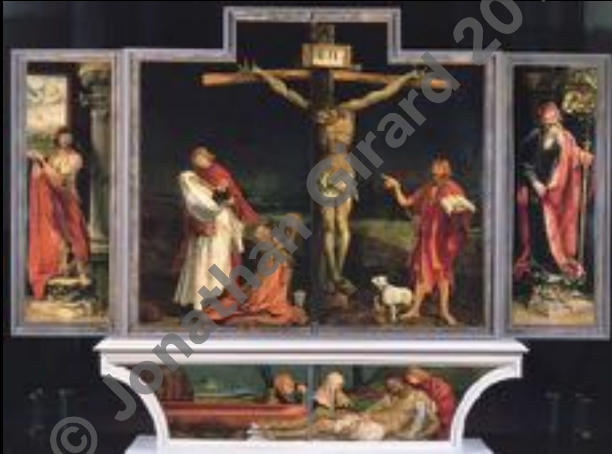
Matthias Grünewald, The Isenheim Altarpiece (ca. 1515)